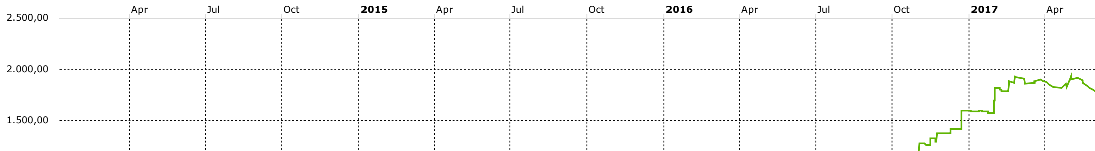
Portfolio SILVER - Stock Pack - by times